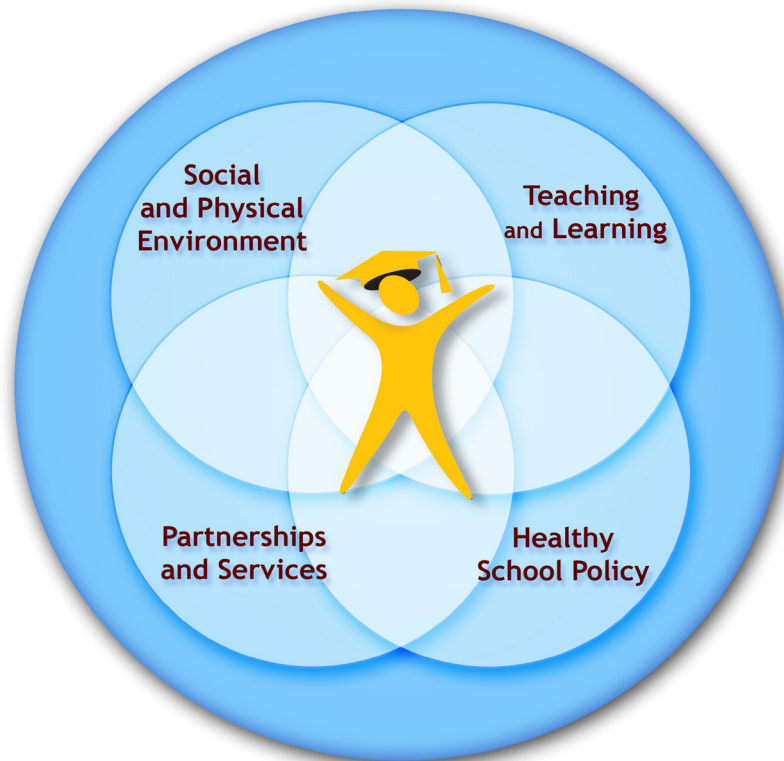
Figure 1: Comprehensive School Health Framework – Joint Consortium for School Health